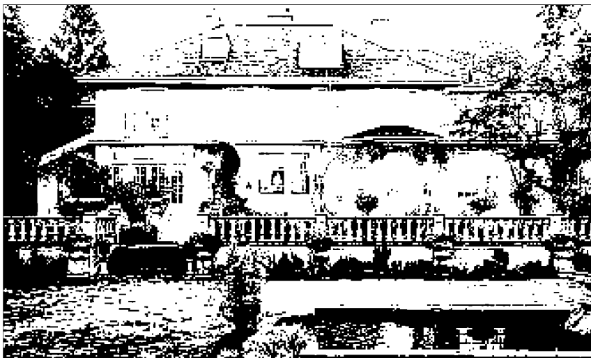
A beautifully manicured Italian Renaissance garden surrounds the Villa Marco Polo.